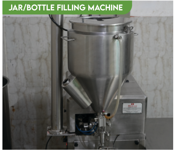
JAR/BOTTLE FILLING MACHINE

Unit : 3 Machines Capacity Per Day : 10,000 Units Per Machine