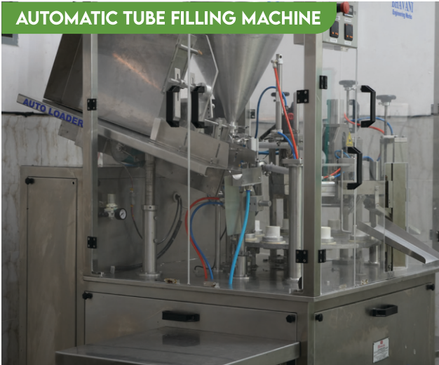
AUTOMATIC TUBE FILLING MACHINE

Unit : 2 Machines Capacity Per Day : 10,000 Unit Per Machine