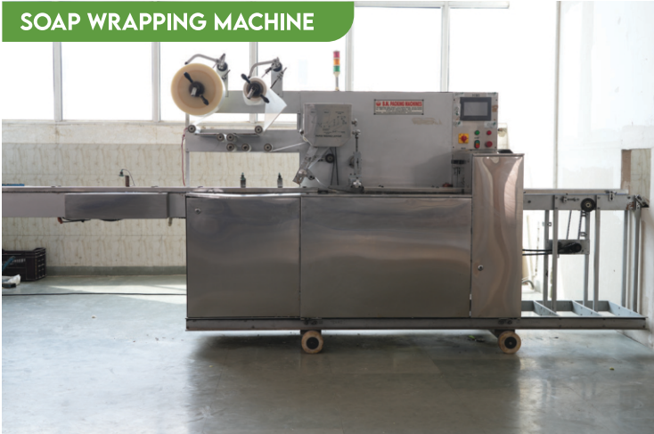
SOAP WRAPPING MACHINE

Unit : 1 Machine Capacity Per Day : 40,000 Units